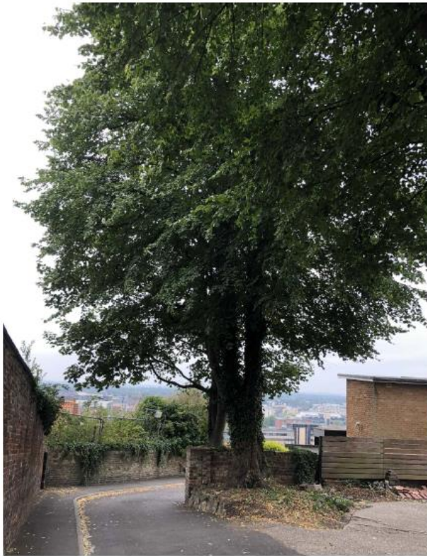
Image 01. T1 - Lime Tree