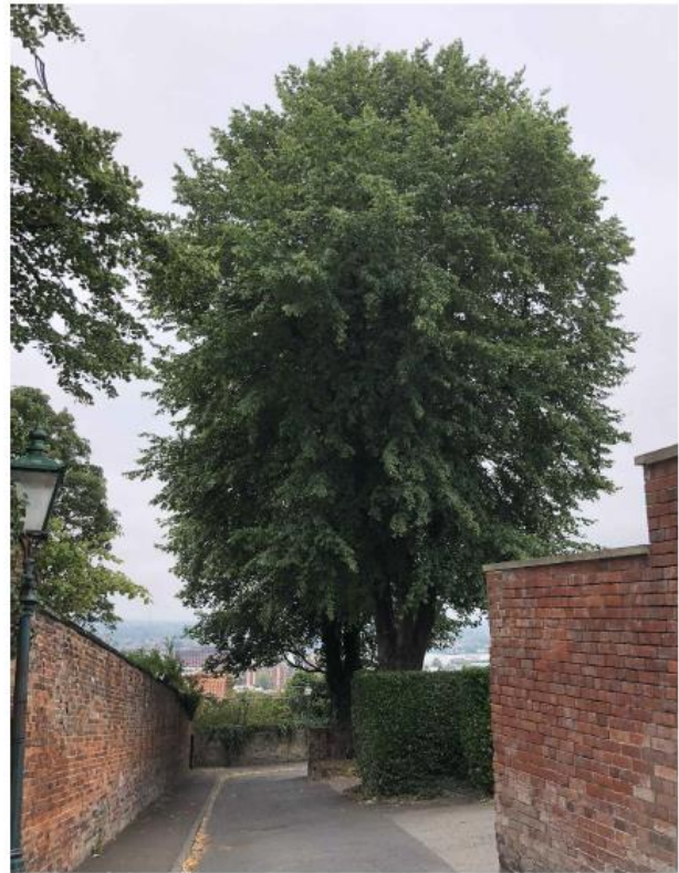
Image 02. T2 - Lime Tree